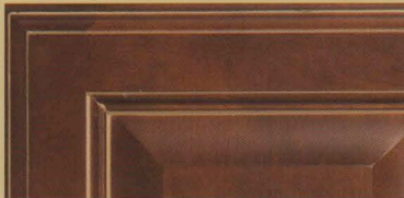
CORDOVAN CAMEL GLAZE