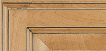
NATURAL CHOCOLATE GLAZE