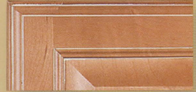
WHEAT ALABASTER GLAZE