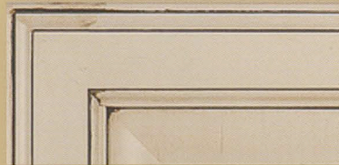
FROST CHOCOLATE GLAZE