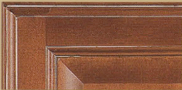
SIENNA ALABASTER GLAZE