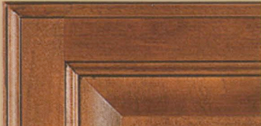
SIENNA CHOCOLATE GLAZE