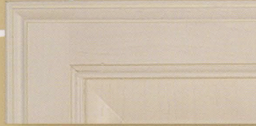
FROST ALABASTER GLAZE