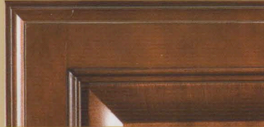
CORDOVAN CHOCOLATE GLAZE