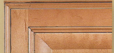
WHEAT CHOCOLATE GLAZE