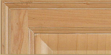
NATURAL ALABASTER GLAZE