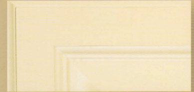
IVORY ALABASTER GLAZE