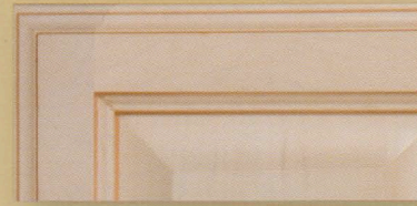
FROST CAMEL GLAZE