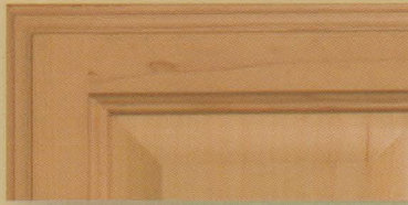
NATURAL CAMEL GLAZE