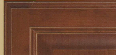
SIENNA CAMEL GLAZE