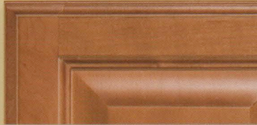
WHEAT CAMEL GLAZE